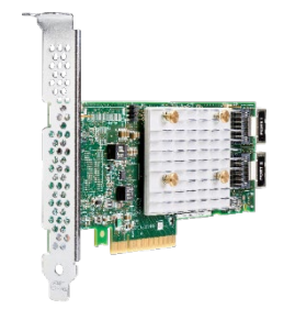
HPE Smart Array E208i-p SR Gen10 Ctrlr (804394-B21)